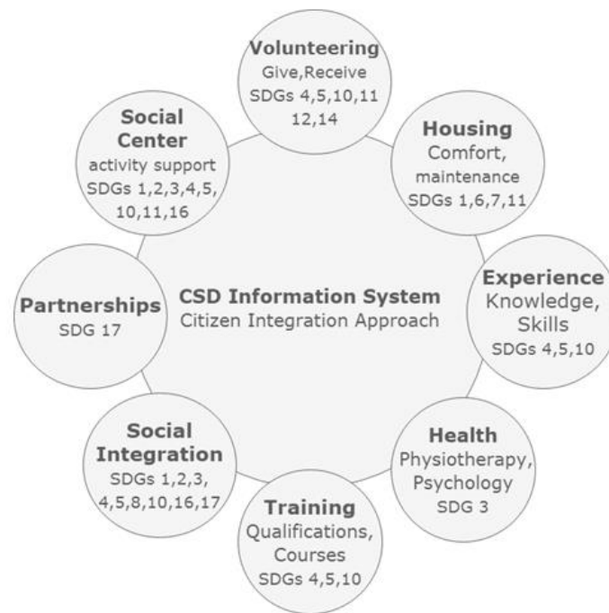
Figure 3. CSD characterization in promoting SDG's