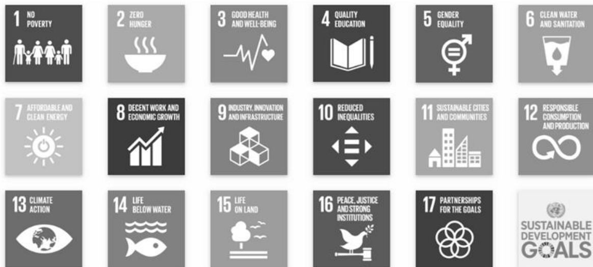
Figure 1. SDG's - Agenda for Sustainable Development

The Sustainable Development Goals (SDGs), also known as Global Goals, were adopted by all United Nations Member States in 2015 as a universal call to action to end poverty, protect the planet and ensure that everyone enjoys peace and prosperity by 2030 (UNDP, 2015).