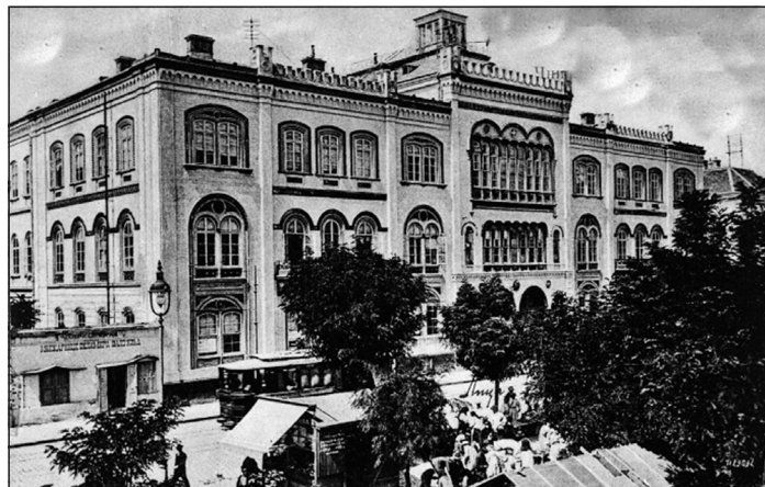
Figure 3. Captain Miša’s building, 1867

What is important is that Captain Miša built his magnificent building in Belgrade, today known as the Captain-Miša building (Figure 3), donated to “his fatherland” for educational purposes ( Univerzitet u Beogradu, 2024 ). Otherwise, the construction of the building began in 1857. Captain Miša Anastasijević donated the magnificent building to “his fatherland” exactly on February 12/24, 1863. The construction of the building itself lasted a relatively long time, until 1864, because they were waiting for the marble from Italy to arrive. Along with the building, all the furniture and equipment for educational and scientific work were donated. On behalf of the state, Prince Mihailo Obrenović thanked the donor, i.e., Captain Miša Anastasijević, in a letter dated February 13/25, 1863. The building houses the Great School, the Gymnasium, the Ministry of Education, the National Library, and the Museum. Today, it is located the Rectorate of the University of Belgrade.