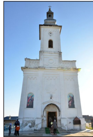
Figure 2. Church of St. Archangels Michael and Gabriel in Clejani, 2013